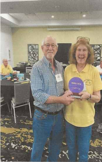
Barbara Smith Hard Luck Award